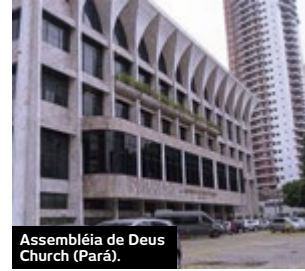
Assembléia de Deus Church (Pará).

A total of five religious institutions were selected for the pilot phase of a Carbon Neutral Churches Project: Assembléia de Deus Church (Pará), Santa Maria Cathedral of the Anglican Episcopal Church of Brazil (Pará), Terreiro Manso Massumbando, Candomblé Bantu (Pará), Comunidade Batista Vida (Acre) and the Metropolitan Catholic Cathedral of Cuiabá (Mato Grosso - incomplete). The intention is that by the end of 2024 the five religious institutions will have neutralized their emissions by planting trees so that they can serve as demonstration units to raise awareness and educate religious communities about the seriousness of the climate and deforestation crises and motivate them to adopt individual, collective and business actions. The project is also designed to help generate greater support for environmental public policies.