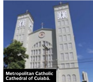
Metropolitan Catholic Cathedral of Cuiabá.