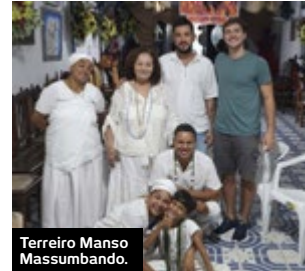
Terreiro Manso Massumbando.