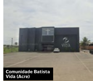
Comunidade Batista Vida (Acre)